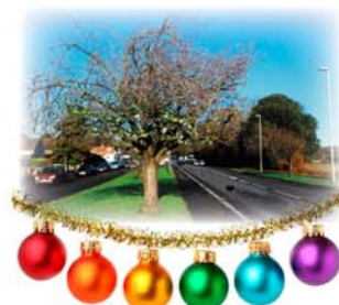
Parley Tinsel Trees

The judges of the Best Kept Village category noted the effort made by the large number of village volunteers who maintain the road verges and public parks, make and maintain roadside flower planters and litter pick in all weathers. Also noted were the efforts of the many residents who mow the verges outside their houses, the smartness of business premises and the All Saints Churchyard. As a result of this West Parley was awarded second prize!