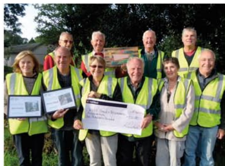
Volunteers with our Prize Awards and a £100 cheque

2016 was a momentous year for many reasons with so much to celebrate here in West Parley. Earlier this year we entered two major Dorset competitions for the first time, achieving great success in both!