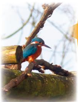
Kingfishers seen in Parley Gardens