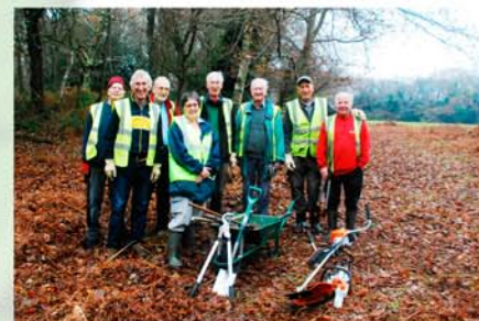
West Parley Volunteers... Literally Pathfinders!

The Environmental Champion Award was made following five years of winter work to clear dense invasive holly, birch and hazel from the 17 acre Parley Wood to restore the natural oak woodland setting. Cut wood has been chipped and used to improve pathways round the Wood and extensive boardwalks have been built using pre-used timber to create all weather access to encourage more residents and visitors to visit the Wood. West Parley won this award outright.