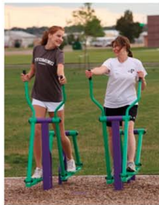
Outdoor fitness kit

You may remember that the council has been planning to erect some outdoor cardio-vascular/fitness apparatus on the Recreation Ground. We can now announce that we have been successful in securing a bid from Tesco to assist with the funding of this project. How successful will depend on YOU! All our local